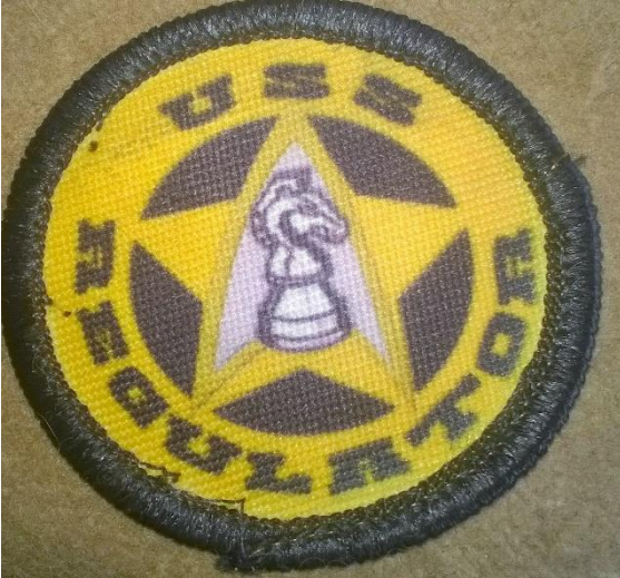
ILLUSTRATION 1: FIRST LOGO, 33RD STARFLEET RANGERS

There were two logos for the 33 rd STARFLEET Rangers, and one for the Thirty-Third STARFLEET MACO.